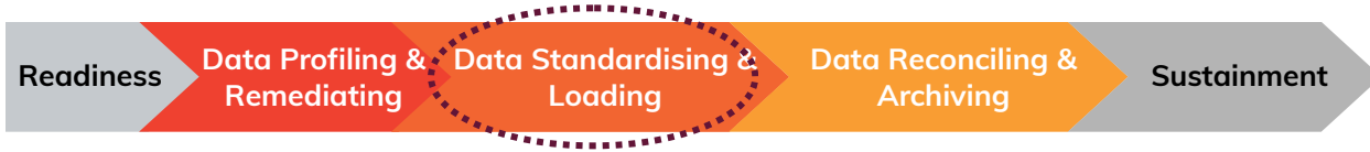
ABOVE: FIGURE 1 DATA MIGRATION PHASES

Data Migration can best be explained as three distinct phases: