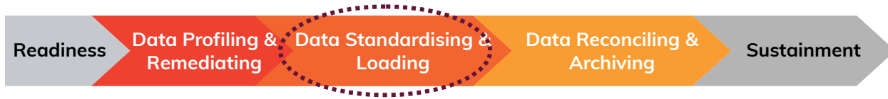
ABOVE: FIGURE 1 DATA MIGRATION PHASES

Data Migration can best be explained as three distinct phases: